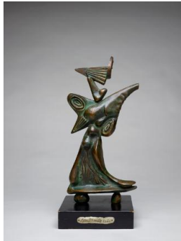
Title: Belial Figure Date: 1945 Primary Maker: David Smith Medium: Bronze