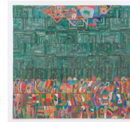
Title: Tightrope: Familiar Yet Complex 2 Date: 2016 Primary Maker: Elias Sime Medium: Reclaimed electronic components and insulated wire on panel