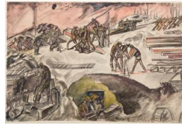
Title: Siege Battery Pulling In Date: 1918 Primary Maker: Wyndham Lewis Medium: Charcoal, pen and ink, watercolor, and gouache wash on paper