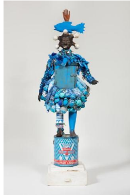
Title: i will never smile again Date: 2016 Primary Maker: Vanessa German Medium: Mixed-media assemblage