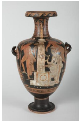
Title: Red-figure hydria (water jar) Date: c. 350-325 B.C.E. Primary Maker: Unknown artist, Greek (Ancient) Medium: Terracotta with slip and pigment