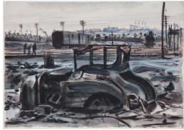
Title: Scrapyard Date: 1933 Primary Maker: Reginald Marsh Medium: Watercolor on paper