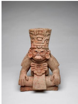
Title: Funerary urn Date: c. 350-600 CE Medium: Terracotta with remnants of pigment