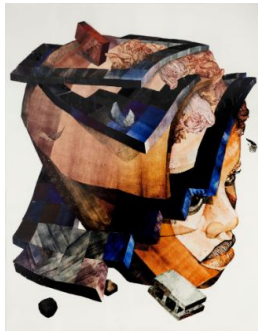
Title: Brick Feather Brick (Your Path is Worn) Date: 2018 Primary Maker: Yashua Klos Medium: Collage with woodcut prints and graphite on paper