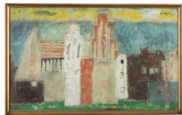
Title: Old Gables VI Date: 1944 Primary Maker: Lyonel Feininger Medium: Oil on canvas