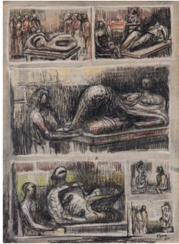
Title: Studies for Sculpture Date: 1946 Primary Maker: Henry Moore Medium: Pencil, wax crayon, coloured crayon, wash, pen and ink, chinagraph on paper