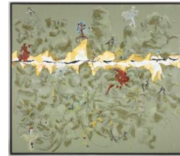
Title: The Binding Problem Date: 1996 Primary Maker: Matthew Ritchie Medium: Oil and felt-tip marker on canvas