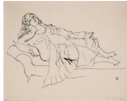
Title: Study for Woman in Blue Date: c. 1919 Primary Maker: Oskar Kokoschka Medium: Ink on paper