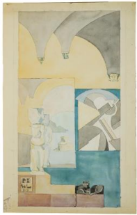
Title: Hommages à GB WL TSE EP Date: 1937 Primary Maker: Dorothy Shakespear Medium: Watercolor on paper, mounted on cardboard