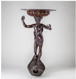
Title: The Boy Date: 1902 Primary Maker: Elihu Vedder Medium: Bronze