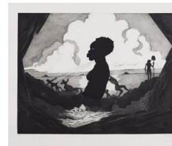
Title: Resurrection Story with Patrons Date: 2017 Primary Maker: Kara Walker Medium: Etching with aquatint, sugar-lift, spit-bite, and drypoint