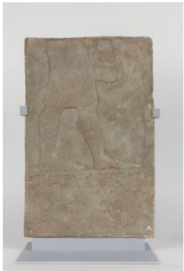
Title: Fragment of a relief from the Northwest Palace at Nimrud Date: c. 883-859 B.C.E. Medium: Gypsum with remnants of red pigment