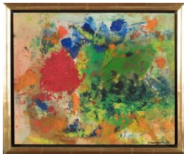
Title: Untitled Date: 1962 Primary Maker: Hans Hofmann Medium: Oil on board