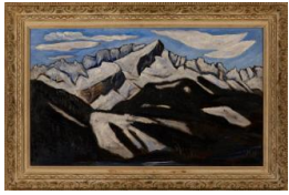
Title: Alpspitze, Mittenwald Road from Gschwandtnerbauer Date: c. 1933-1934 Primary Maker: Marsden Hartley Medium: Oil on cardboard