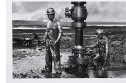
Title: Kuwait Date: 1991 Primary Maker: Sebastião Salgado Medium: Gelatin silver print