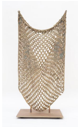
Title: Untitled Date: 2016 Primary Maker: Michelle Grabner Medium: Bronze