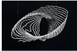
Title: Lemniscate Date: 2014 Primary Maker: Alyson Shotz Medium: Welded mill-finish aluminum