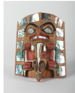
Title: Headdress frontlet Date: c. 1825-1850 Medium: Wood with paint and abalone