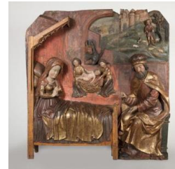
Title: Nativity Date: c. 1500-1510 Medium: Limewood with polychrome and gilding