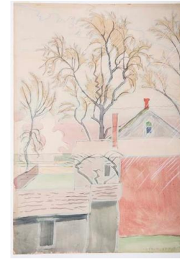
Title: Spring Rain Date: April 1, 1916 Primary Maker: Charles E. Burchfield Medium: Watercolor and pencil on paper